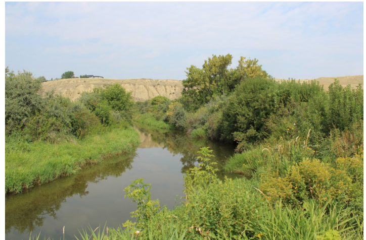
Healthy Riparian Area

The South East Alberta Watershed Alliance (SEAWA) is a multi-stakeholder, volunteer based, not-for-profit society designated as a Watershed Planning and Advisory Council (WPAC) by the Government of Alberta to help achieve the goals of the Water for Life strategy. ( www.waterforlife.alberta.ca )