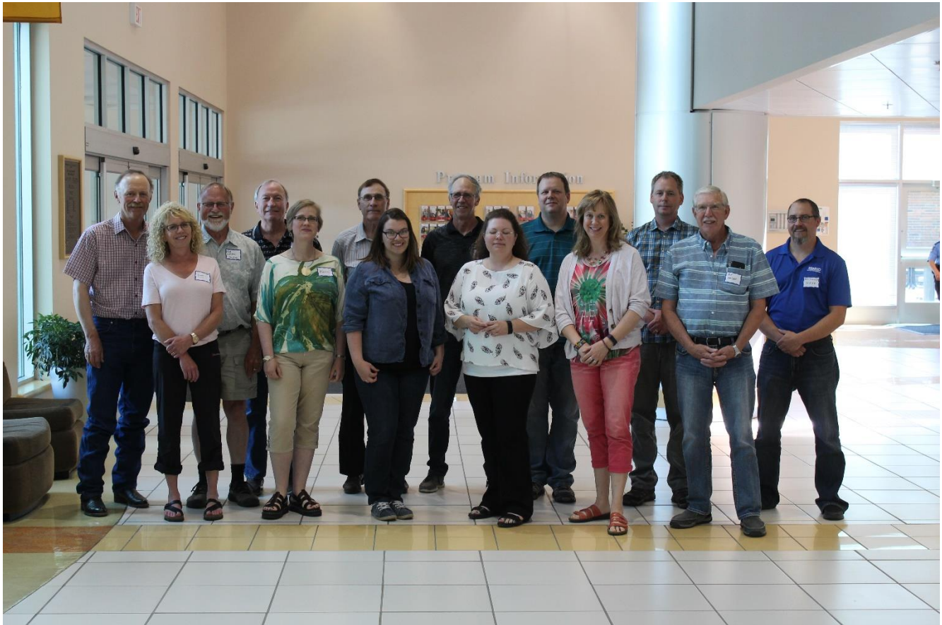
Figure 2 The SEAWA Board, June 13, 2019 Annual General Meeting