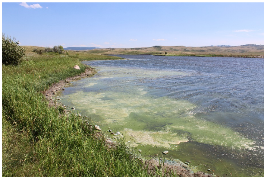
Blue-green algae ( Cyanobacteria ). Photo taken at the Bullshead Reservoir following an Alberta Health Services advisory on August 3, 2018.